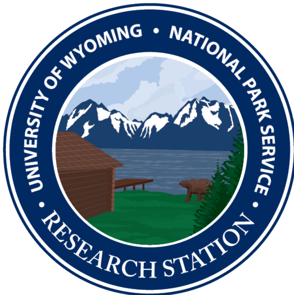
Figure 1. Example of large figure, spanning the text width.